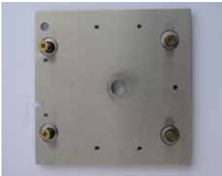
Spark Stand Plate with 8 mm electrode hole

The SPECTROMAXx covers a wide range of analysis requirements. One major challenge relates to the various shapes and sizes of the samples and the optimized position on the spark stand. The new adapter kit is focused on ease of use and flexibility.