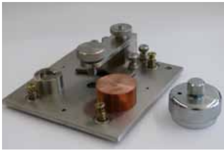
Small Parts Adapter Kit (Part Nr. 75260151)

The SPECTROMAXx covers a wide range of analysis requirements. One major challenge relates to the various shapes and sizes of the samples and the optimized position on the spark stand. The new adapter kit is focused on ease of use and flexibility.