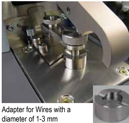
Adapter for Wires with a diameter of 1-3 mm