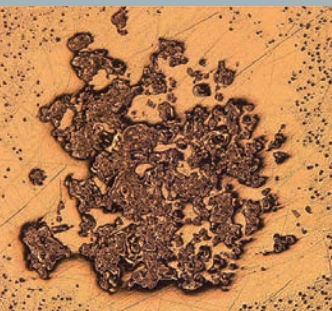
Figure 1: Re-polished sample with pre-spark crater